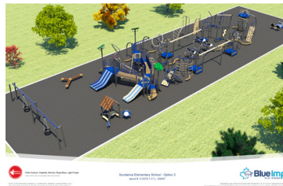
Renderings of the proposed inclusive playground design by BDI a Canadian Vendor.

Your support would not only help us provide a safe and inclusive space for children today, but also leave a lasting legacy for generations to come.